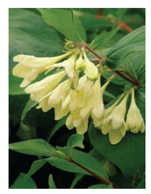
Weigela 'Lemon Ice' blooms much earlier than other cultivars — in late April and May — and lightly reblooms all summer through fall.

Plain Jane reputation. Yes, it had pretty blooms, but it didn't stand out in parts of the country where a wider plant palette could grow.