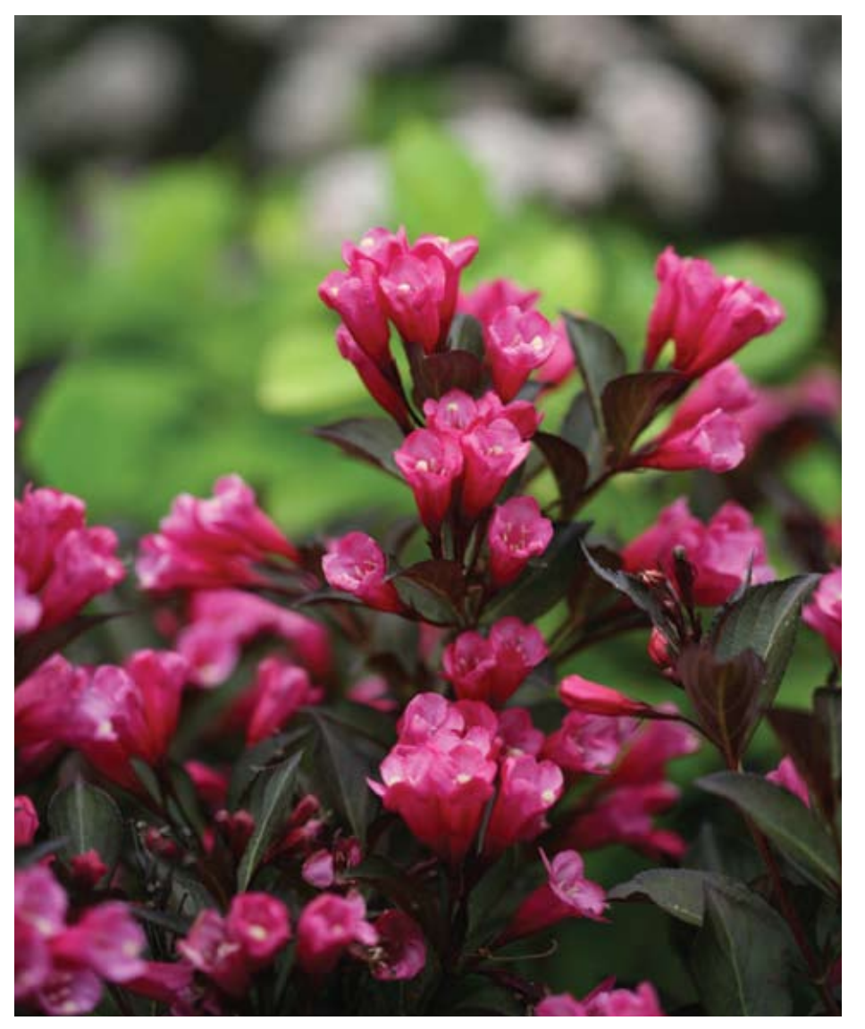
There's no mistaking where 'Wine & Roses' got its name from; its deep purple foliage is the color of a fine Burgundy, accented with a profusion of rosy blooms.

ILBUR-ELLIS Logo and Ideas to Grow With are registered trademarks of Wilbur-Ellis Company. K-1012-790