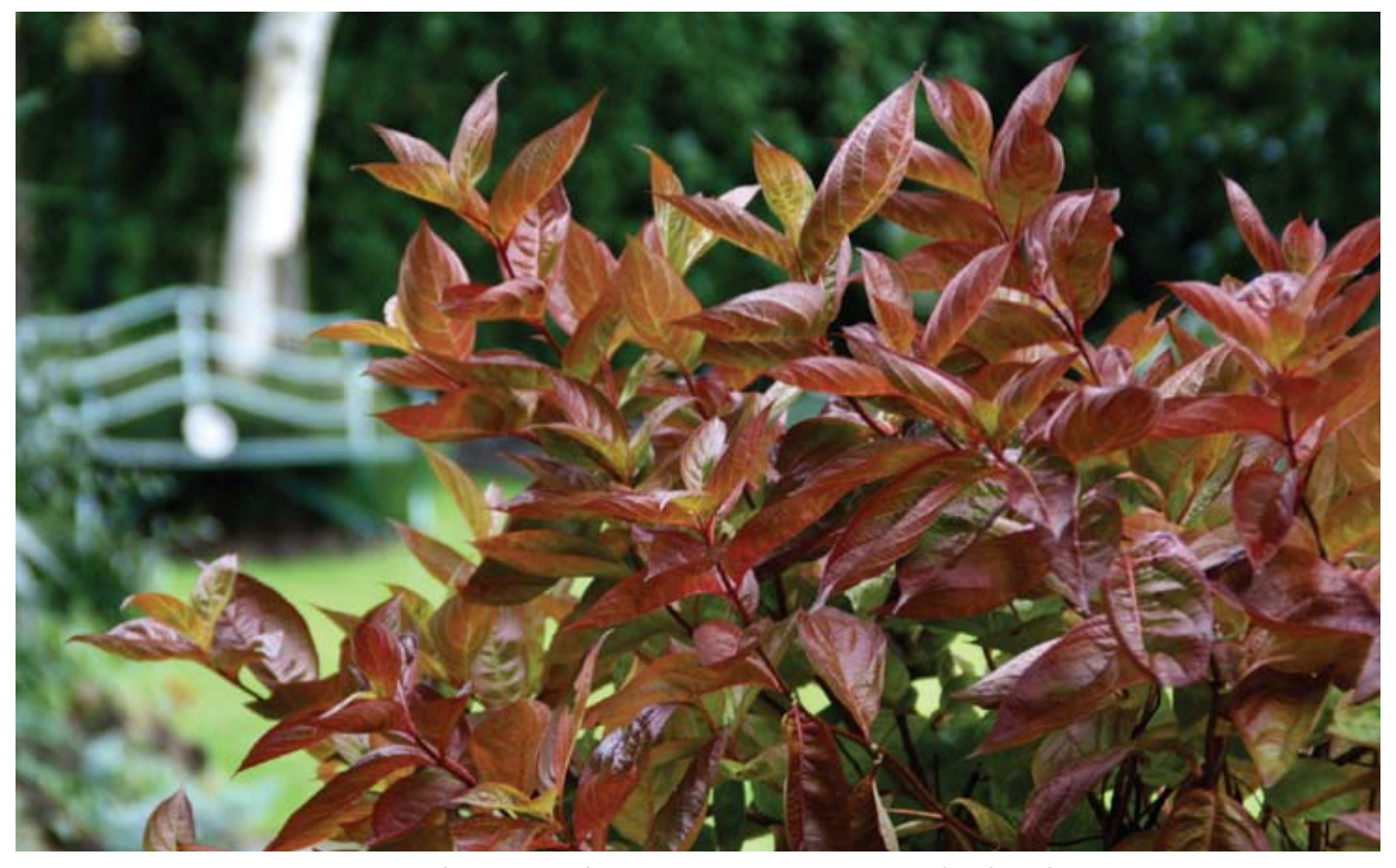
Burgundy Fire weigela is also known as "Wings of Fire" because of its leaves which start the season with a faint flush of pink color, then acquire red tones in the summer, turning a deep red wine hue in the fall.

(Weigela florida 'Bokrashine'), which reaches 5–6 feet tall and 3–4 feet wide, gets its name from the plant's shiny burgundy leaves. The unique, polished foliage serves as a beautiful backdrop for an abundant show of pink, funnel-shaped flowers in May and June. Then, the foliage adds rich color to the garden the rest of the season. Shining Sensation also features graceful arching stems that make it an interesting border plant.