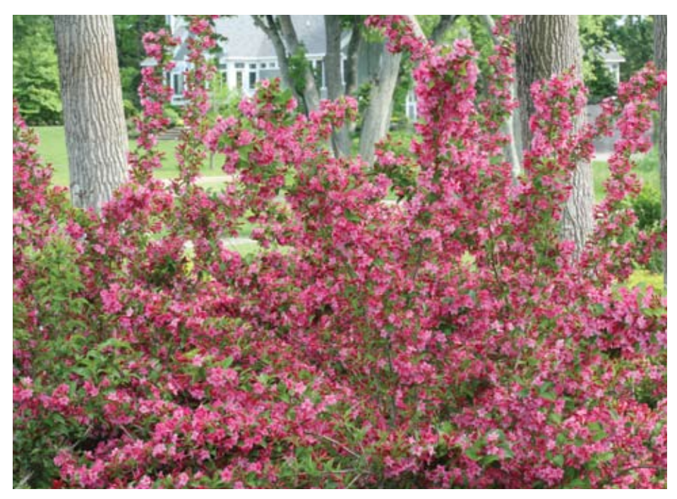
The Sonic Bloom<sup>™</sup> series of reblooming weigelas burst with color in May and continue blooming in waves until frost.