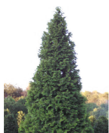
Thuja plicata x standishii 'Virginian' PP#26684 P3