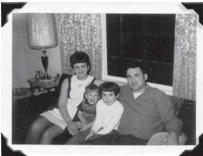
The Zampini Family