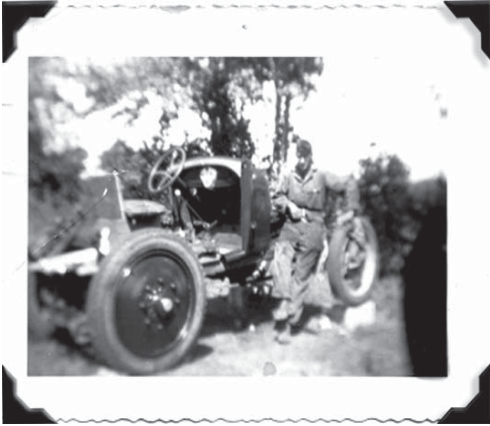
1949 First Tractor -

(pictured above with Jim) Homemade from a Model A Ford front and the rear of a Greyhound bus - Cost $250.